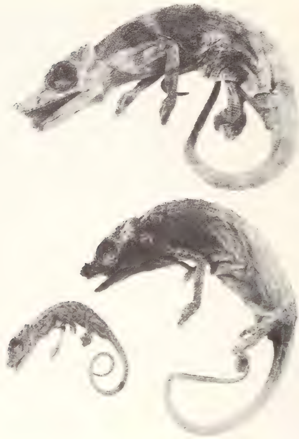
Fig. 2: Three of the four syntypes of B. tenue , ZMB 11348: 1–3, male, female, juvenile.

fig. 2). This is odd because in literature reference is made to four syntypes (cf. Matschie, 1892; Werner, 1902 a.o.). Another specimen (ZMB 22627) collected by Conradt from the type locality as well might be the fourth type specimen. However, it is incomprehensible as to why it should not have been included in the original type series under the same catalogue number. Moreover, at closer examination the putative specimen of B. tenue proved to be a B. xenorhinum ! The locality attached, viz. Derema, does not correspond with the species involved as B. xenorhinum has thus far only been recorded from the Ruwenzori Mts. (cf. De Witte, 1965). The possibility of a new locality is highly unlikely, an accidental exchange with some other specimen seems more plausible.